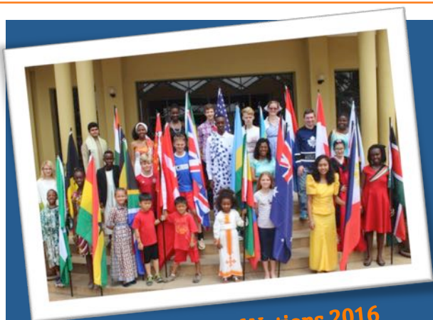
KICS Parade of Nations 2016